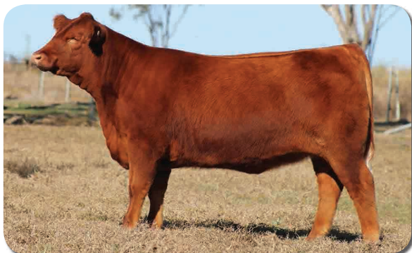
Top priced female - Lot 36 GK Red 624 Ruba U9 Offered by GK Livestock. Purchased by Rick Cruff, Roughrider Reds, Biarra.